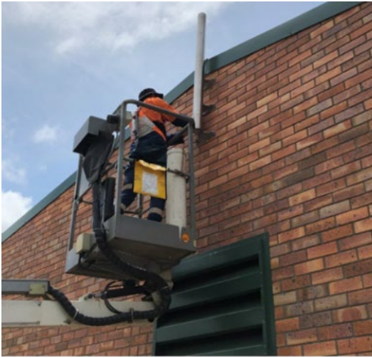
Muswellbrook CORS construction