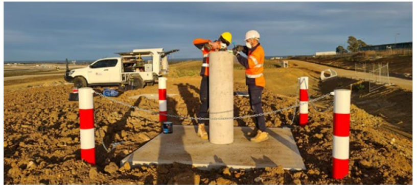
WSIA CORS construction